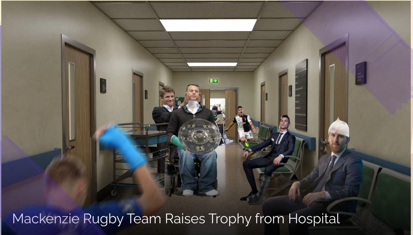
Mackenzie Rugby Team Raises Trophy from Hospital