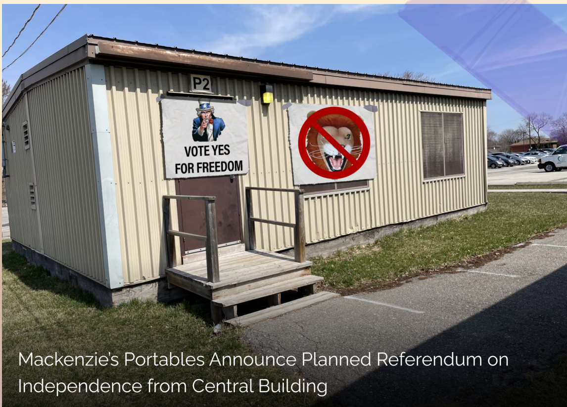
Mackenzie's Portables Announce Planned Referendum on Independence from Central Building